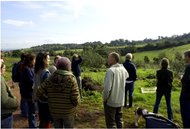
Open day at Shillingford on CFF launch tour